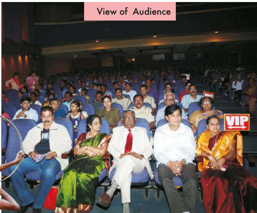
View of Audience