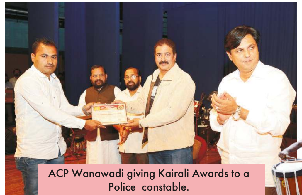
ACP Wanawadi giving Kairali Awards to a Police constable.