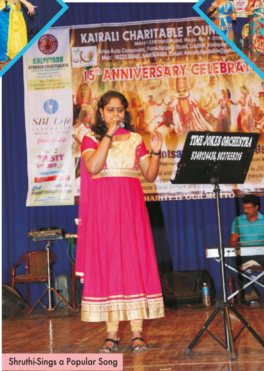
Shruthi-Sings a Popular Song