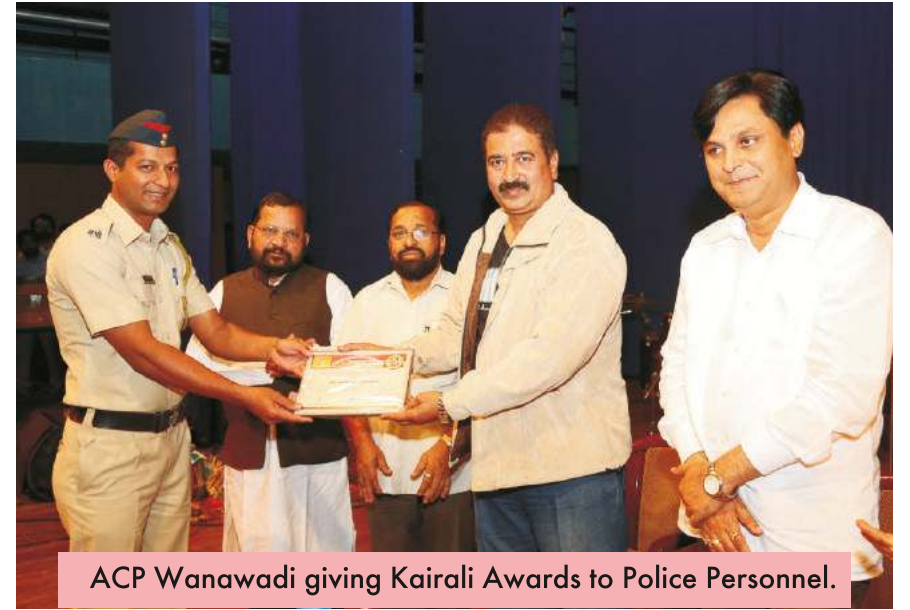
ACP Wanawadi giving Kairali Awards to Police Personnel.